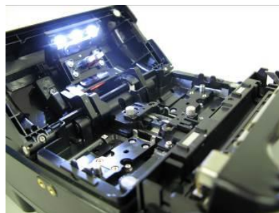
Illumination lamp: 3+1 LED