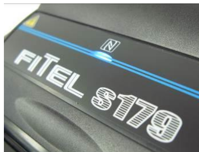
NFC: Lock and Unlock